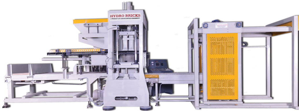
FULLY AUTOMATIC CONCRETE / PAVER / BRICK MACHINE