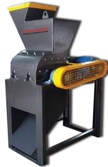
FLY ASH BRICK CRUSHER